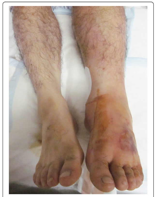
Figure 1 Clinical presentation on day 6. The patient experienced a burning sensation, tenderness, and redness in his left leg, from the upper part of his foot to his knee. Blisters are shown on the dorsum of the foot.

and minocycline (200 mg/day) were initiated. However, on the fourth day of admission, the antimicrobial drugs were changed to ceftazidime at 4 g/day, as 2 sets of blood culture tests revealed gram-negative bacilli. Until then, the redness in his ankle had not expanded. On day 5, the erythematous, warmth and pain spread to his knee joint, and blisters were observed on the upper part of his foot (Figure 1). The patient was diagnosed with necrotizing fasciitis and a fasciotomy was conducted. The underlying muscle appeared healthy, and further debridement was avoided. The pathology of the dorsum of his left foot revealed inflamed skin and soft tissue, with necrosis consistent with necrotizing fasciitis. Laboratory tests showed an inflammatory reaction (WBC count, 13,500/µL; CRP, 196.3 mg/L), and hyperglycemia (192 mg/dL). Thus, the Laboratory Risk Indicator for Necrotizing Fasciitis (LRINEC) score [4] was 6 (intermediate risk). The smear from the fasciotomy site and blood culture tests revealed gram-negative bacilli (Figure 2A), and the infecting bacterium was oxidase-positive and produced grey colonies, with a 4.3-mm hemolytic zone on sheep blood-agar plates (Figure 2B); non-pigmented colonies were found on bromothymol-blue lactose agar plates, suggesting that C. haemolyticum was the causative