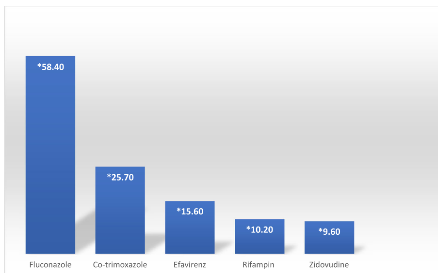
Fig. 1 Drugs most implicated for any potential drug-drug interaction by percentage of occurrence in overall analysis. *Percentage calculated by dividing number of interactions involving identified drug with the total number of observed pDDI events (4582 total). Note that some of the identified drugs also interact with each other